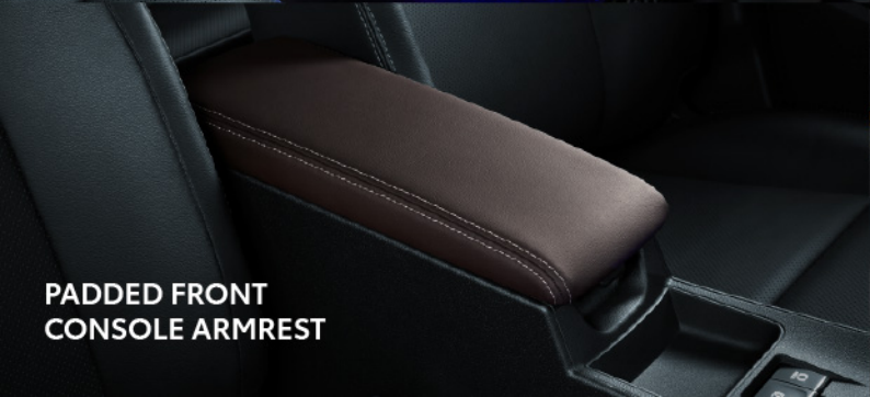
PADDED FRONT CONSOLE ARMREST