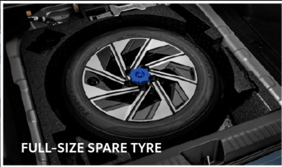
FULL-SIZE SPARE TYRE